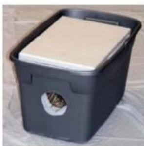
Add Styrofoam lid