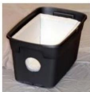
Insert Styrofoam cooler and cut hole in Styrofoam to match tote