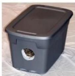
Add tote lid—finished!

After the cats have begun using the tote shelter, consider adding a door flap made of heavy plastic or heavy vinyl for further wind/weather protection.