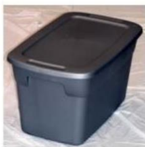
Start with a 30 gallon tote for one to two cats

Plastic Tote Shelter — A shelter anybody can make; suitable for one to two cats.