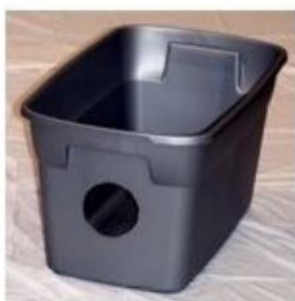
Cut 5 1/2" diameter hole in tote